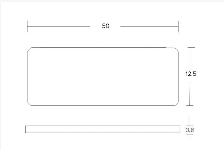
Measurements shown in mm